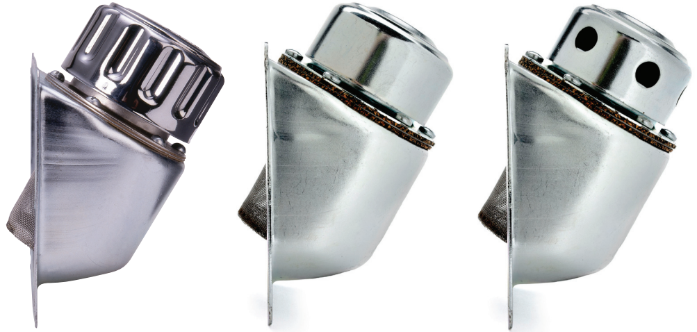
SM assemblies are available with several caps see catalog Page 4b

Burrs should be removed from around the 3" x 3.5" "opening and bolt holes, to provide a good sealing surface for the housing flange gasket. The metal surface should be flat in the mounting area, within the limits of 1/16" thick flange gasket furnished. Parts should be installed as shown in (figure 4). CARE SHOULD BE TAKEN TO MAKE SURE THE PLASTIC SEALS ARE LOCATED UNDER EACH OF THE HEX HEAD BOLT HEADS, with the plate washers used inside of the reservoir with the hex nuts. This is to provide for sealing against any possible seepage following along the crest of the bolt heads.