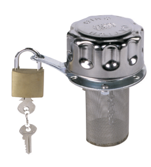
Locking cap-3/8" Hole Accepts Padlock

Prevents tampering of equipment. See page 1-2b.